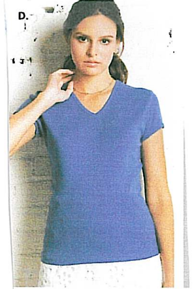
Baby rib v-neck tee